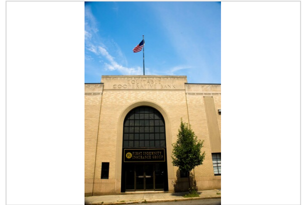
nh 2nd day (1 of 13)